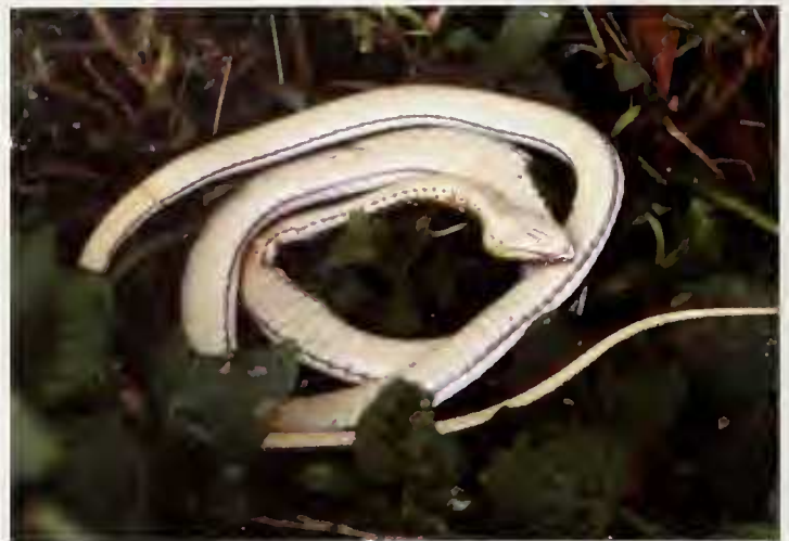
Fig. 17. The same specimen from below.

so earlier records of P. sibilans from West Africa (e.g. Chabanaud 1916) refer to this form which, in our opinion, is not conspecific with the true P. sibilans from Egypt. Many not yet fully grown but nonetheless adult (mature) specimens may retain more or less distinct reddish dorsolateral stripes along the body. The belly is light whitish to yellowish and patternless (no dark hairlines along the ventral plates), but supralabials, sublabials and gulars show some dark pigmented spots (see Böhme et al. 1996). The anal shield is entire. Its taxonomic status and nomenclatural status needs still to be assessed.